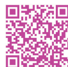
Sculpture Trail Instagram

The Knippenberg Center for Education is located near the parking lots with accessible parking adjacent to the building. The center is open April through October, noon to 4 pm Tuesdays through Sundays except during emergency conditions. Accessible bathrooms are available when the building is open.