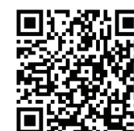
Sculpture Trail Facebook